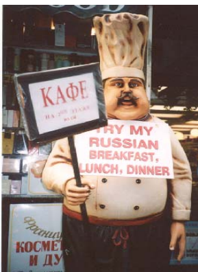
A local Russian restaurant advertisement in Brighton Beach, Brooklyn.